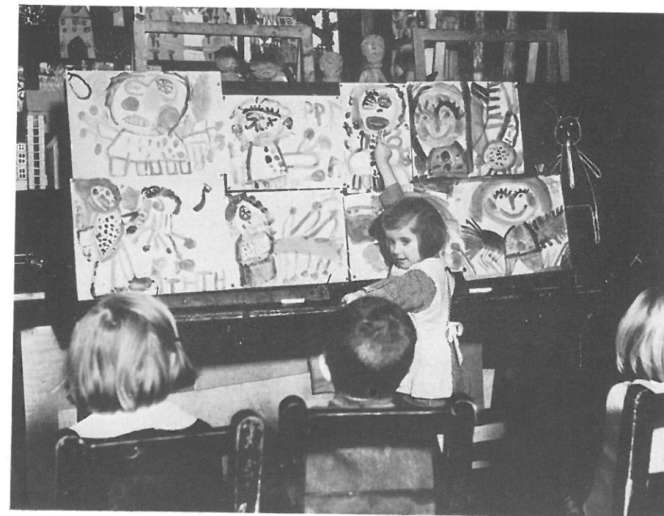
A child explaining her work to other pupils.

Why did Cizek become an opponent of the intellectual school? Because of the conviction that it gives nothing to the child but deprives him of something, so that the children generally leave such a school poorer than they entered it. That kind of school is part of the tragedy of our modern civilization.—A child is so pliable. How easy it is to make patterns and comfortable “citizens” out of these little children’s bodies and souls! A child has his own handwriting, his own laws and his own ways of creating. How often this has been misunderstood! Our modern civilization tends already too much towards producing as quickly as possible bored little adults, able only to consume, out of originally creative and gifted children. Perhaps that is the reason why in recent