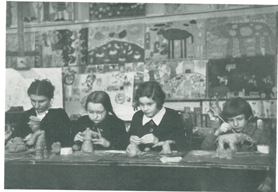
Modelling in clay.

"The Juvenile Art Class is not a school, it is a work centre to which the children come of their own free will and where they can work just as their talents and inclinations prompt them. My educational task consists in furthering the creative giving of form, and preventing imitation and copying. A drawing or any other product of a child is good, if the work accomplished accords