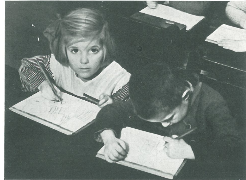
Brother and sister.