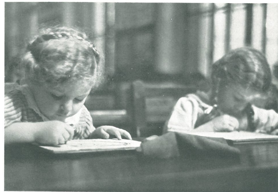
Three and five years old.

This was the rigid system of "art" teaching which the artist Cizek found. One need not be surprised that from the very beginning he met with the strongest opposition, particularly from the art teachers. Here we may quote the Austrian author Hermann Bahr: "An expert is a man who has learned something and does not understand it." It was particularly the drawing teachers who fanatically opposed him, even sending petitions to the Minister